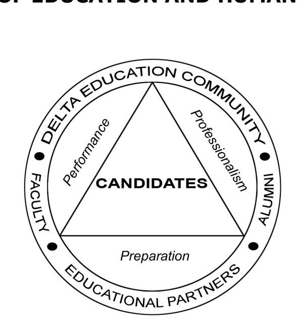
Master of Arts in Teaching Handbook